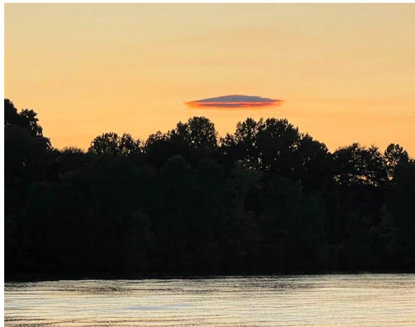
Large UFO picture by Elke